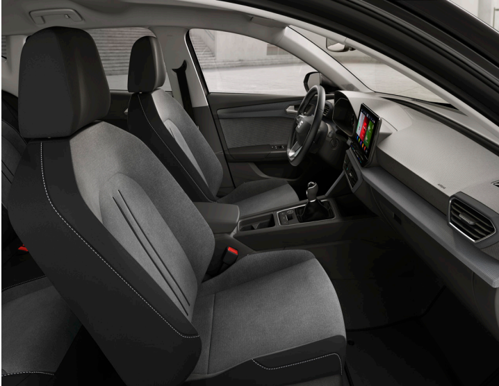
CLOTH - AX