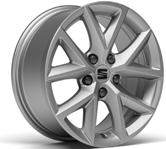
URBAN 16" ALLOY WHEELS SE